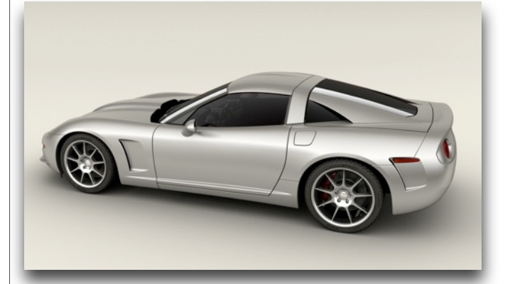
Callaway C16 Coupe 650 hp

Complete...Powerfully Engineered Automobiles in 3 models: